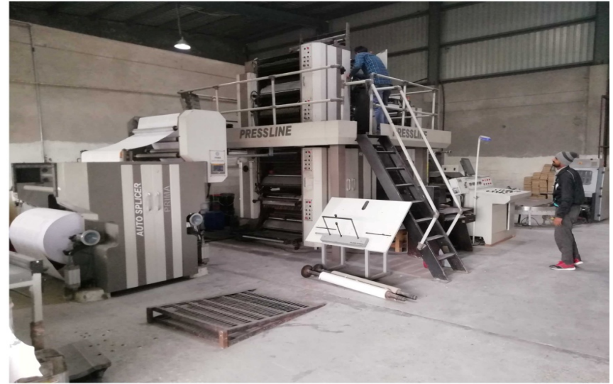
Pressline Web Offset Machine