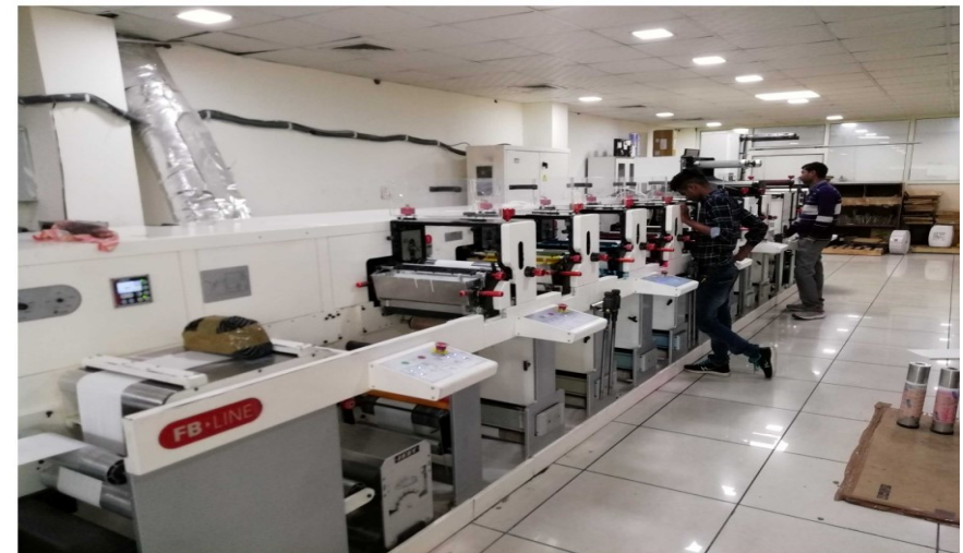
Nilpeter Printing Machine (FLEX)