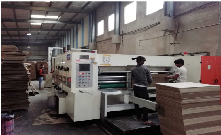
Printing Machine (Corrugation)