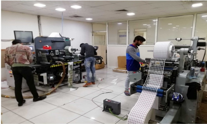
BST & Punching Machine (FLEXO)