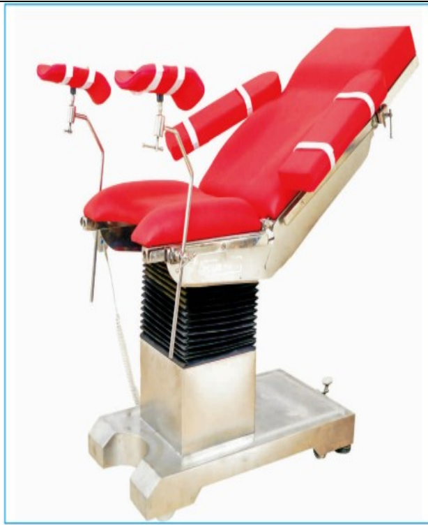
UMS - 1013-M Hydraulic C-ARM table