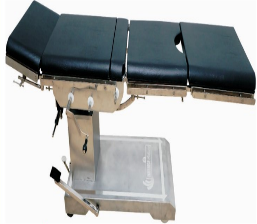
UMS - 1013-T Hydraulic C-ARM table